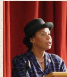
Top Left: Over 100 local nonprofit leaders attended the event.